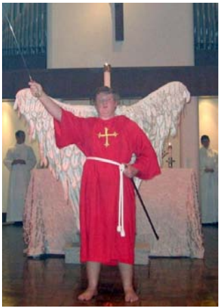
Monies raised by the Women's Outreach Ministry help to fund travel for Redeemer youth to the annual St. Michael's Conference in Massachusetts