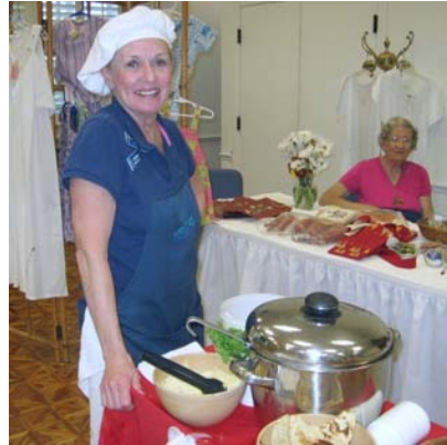
Women's Outreach Ministry volunteers at the annual Charity Bazaar