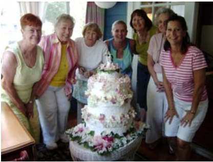
Members of the Women's Outreach Ministry gather to plan the 2007 Wedding Tea

The Women's Outreach Ministry sees our individual and corporate lives as centered in Christ. Together we focus on bringing our Lord's love to the world around us both near and far. Through fellowship and fundraising we reach out to those in need locally and around the world.