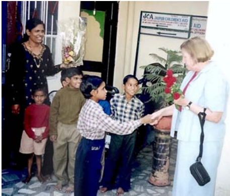
WOM funds contribute to a home for boys in India via Jaipur Children's Aid

The Women's Outreach Ministry is associated in ministry with: