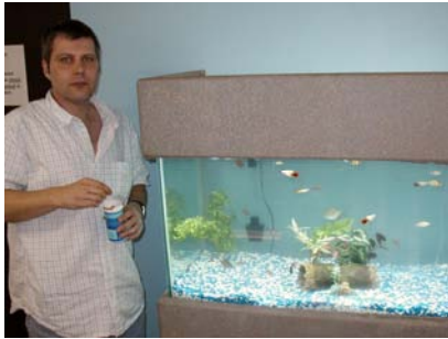
The WOM has donated many needed items to Prospect House (a mental health drop-in center), such as a washing machine and a fish tank